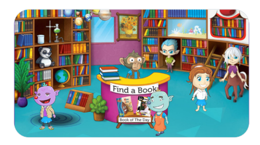
What book theme would I find if I clicked on the panda?