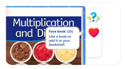
What button can you click on to favorite a book?