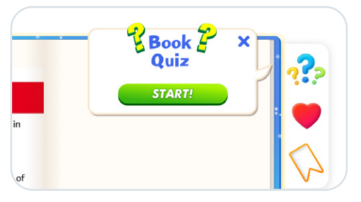
What do you have to do to officially finish a book?