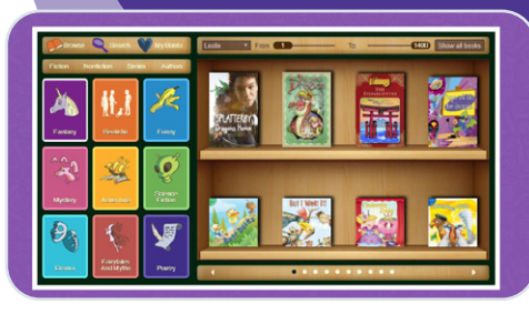
Name two types of fiction books that you can browse for.