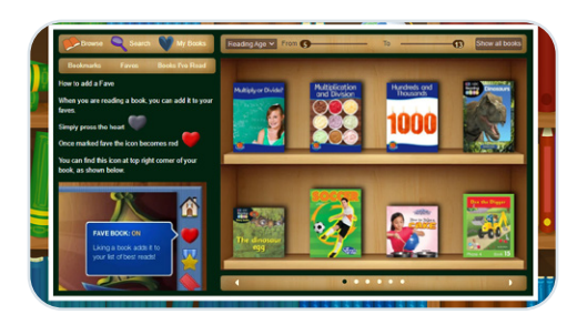
What do you click on to find your bookmarks, favorites, and books you've read?